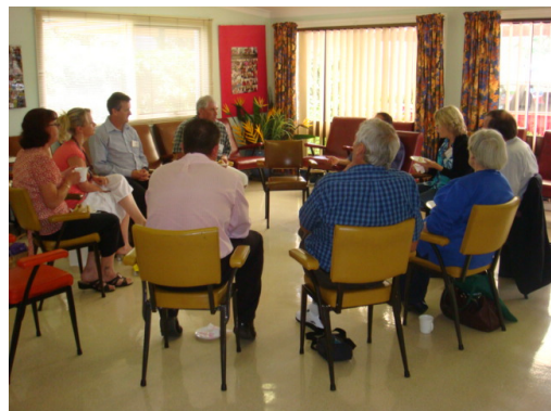
The last Sydney Carers Group meeting included six men!

Location: 21 Chatham Road, West Ryde Group Meetings: See Schedule (Light lunch provided) Contact: 02 9874 9777