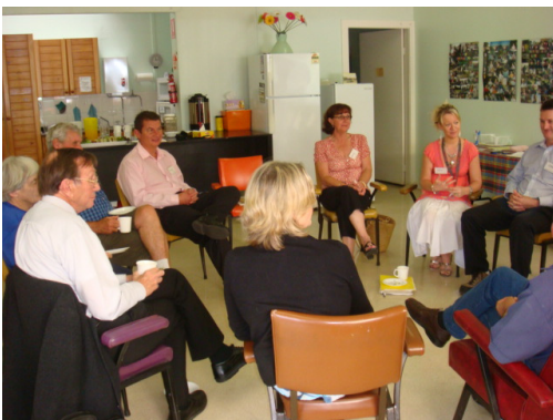
The Sydney Carers Group in action.