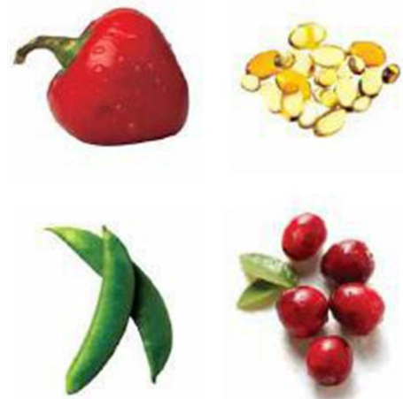
Some antioxidant-rich foods.